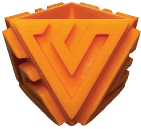
Original 90×65 mm